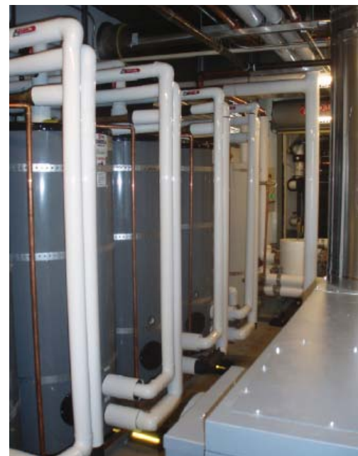
Mechanical room configuration